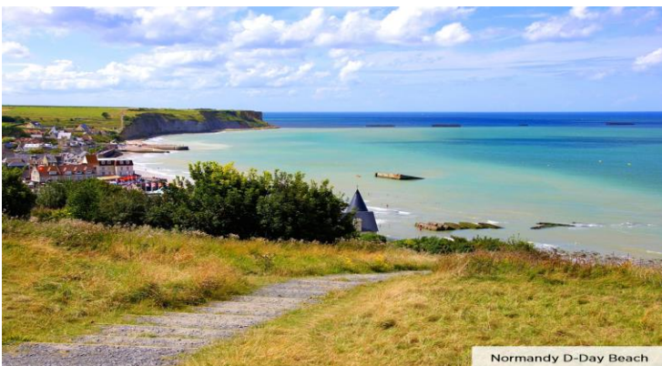
Normandy D-Day Beach

More details will be coming on unique experiences with Erin -A day in Paris with Erin -A painting demonstration -Dinner with Erin in the Chef's Table Restaurant