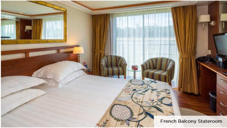
French Balcony Stateroom

7-night cruise | June 22-29, 2024 | Aboard AmaDante