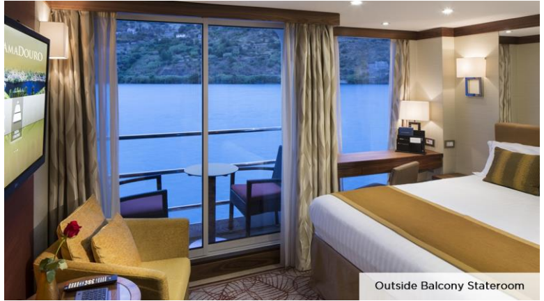
Outside Balcony Stateroom