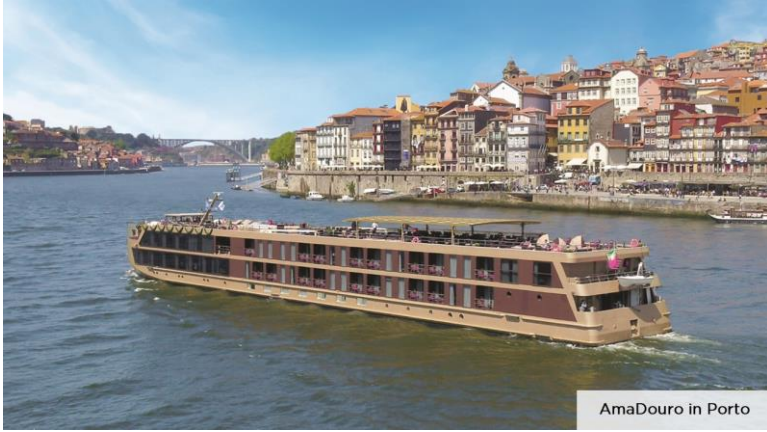
AmaDouro in Porto

7-night cruise | July 6-13, 2024 | Aboard AmaDouro